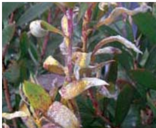
Melaleuca plant with fresh infection.

Visit the website for more information http://www.dpi.nsw.gov.au/biosecurity/plant/myrtle-rust and go to the "resources page". There are some great fact sheets and brochures.