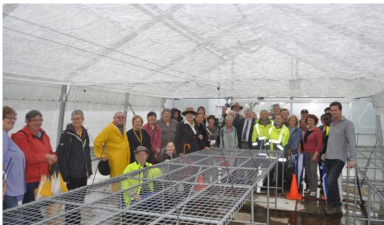
Guests tour the new greenhouse.