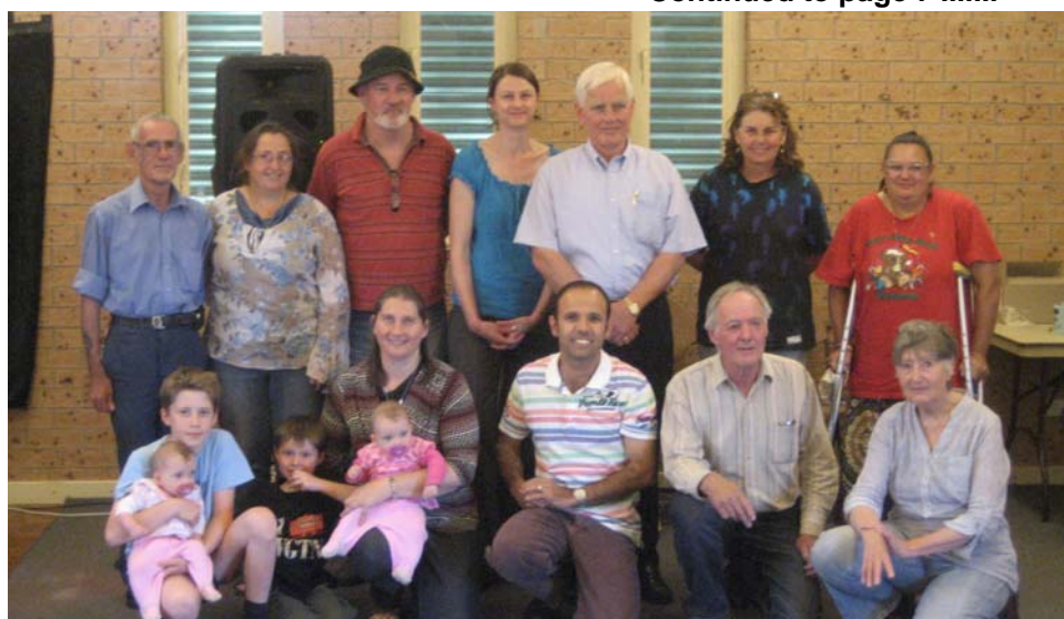
Winners are grinners at the Bushcare Landcare Awards.

If you are interested in being involved in any of the Hawkesbury Bushcare sites, please contact Council's Community Bushcare Officer on 4560 4525, or email: mgauci@hawkesbury.nsw.gov.au . We would love to hear from you.