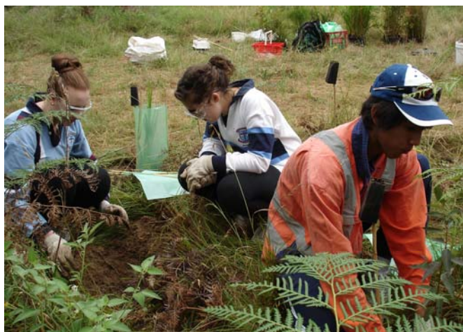
Eco Group students planting in harmony on the banks of the mighty Hawkesbury River, at Charles Kemp Recreation Reserve.

The rest of the Eco Group and I left school on a cloudy day and arrived twenty minutes later at Charles Kemp Reserve. We trudged down to the