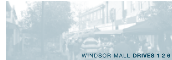
WINDSOR MALL DRIVES 1 2 6