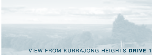
VIEW FROM KURRAJONG HEIGHTS DRIVE 1