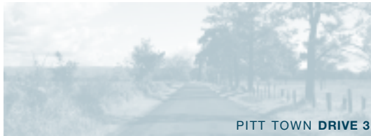
PITT TOWN DRIVE 3

With so much to see and do in the Hawkesbury – beautiful scenery, national parks, majestic rivers, quiet secret places, historic townships, heritage buildings – we offer you directions for self drive tours which highlight what the area has to offer. All of the drives radiate from Windsor, an easy drive one hour north-west of Sydney. Make sure you take time to relax and experience the special things that the Hawkesbury has to offer – visit the galleries and artist studios, buy direct from the grower, enjoy a picnic or one of our many restaurants.