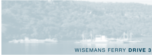
WISEMANS FERRY DRIVE 3