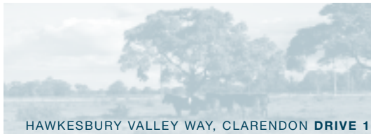
HAWKESBURY VALLEY WAY, CLARENDON DRIVE 1