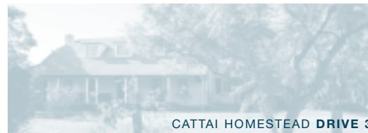
CATTAI HOMESTEAD DRIVE 3