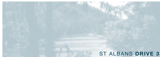
ST ALBANS DRIVE 3

ST ALBANS A meandering drive beside the Macdonald River will lead you through this secluded valley with its steep sandstone cliffs to the village of St Albans. Have a break at the Settlers Arms Inn which has provided hospitality for weary travellers since 1836.