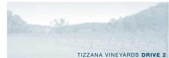
TIZZANA VINEYARDS DRIVE 2