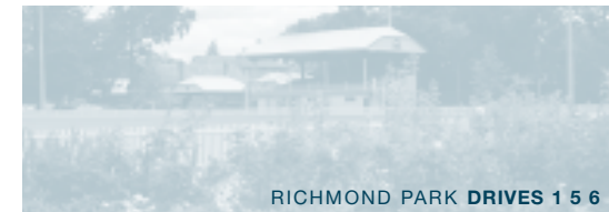
RICHMOND PARK DRIVES 1 5 6