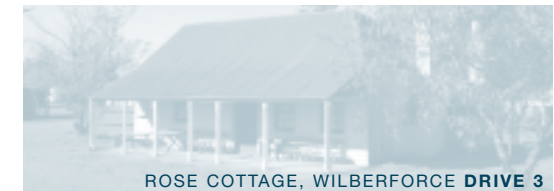
ROSE COTTAGE, WILBERFORCE DRIVE 3

SACKVILLE Visit nearby historic Jubilee Vineyard and Tizzana Winery, where you can taste our local wine, or explore the old churches including St Thomas Anglican Church and the Methodist Church and Manse (viewed across the river on Mud Island).