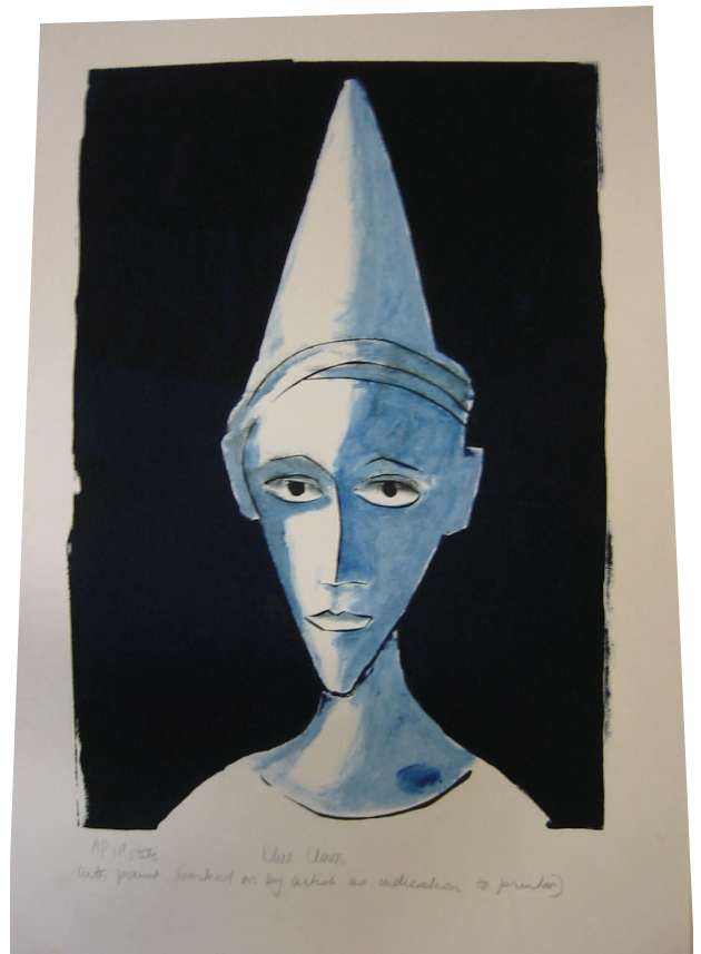
Robert Dickerson, Blue Clown , silkscreen blue ink with hand colouring 662 x 510mm

In developing a broader exhibition exploring the 'Circus in Australian Art' we have aimed for more than just a simplistic selection of circus images by visual artists, pulled together because they have a common theme. The exhibition aims to offer intellectual access for a broad range of audiences from children to adults, from circus lovers to art lovers. The new residency works by leading Australian artists, coupled together with historic works from public and private collections, provide an exploration of how both traditional and contemporary art forms represent the circus on a psychological and symbolic level as well as the changing attitudes toward circus itself.