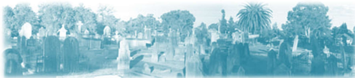
Windsor Catholic Cemetery

For Hawkesbury cemeteries visit the Local Studies Collection. Also check Hawkesbury Cemetery Register http://www.hawkesbury.net.au/cemetery/ For Australian cemeteries http://www.australiancemeteries.com/ or http://www.coraweb.com.au/cemetaus.htm