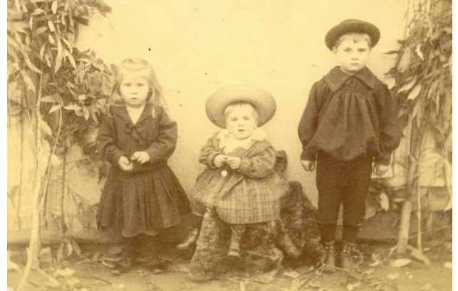
Photo: Family group.

People start researching their family history for many reasons but it is about discovering who you are and where you came from. It provides an understanding of history, where your family fitted into the puzzle. It can be time consuming and may involve patience but is also very rewarding. This Fact Sheet outlines some of the steps if you are starting on your journey and is part of a series of helpful guides to navigate your family and local history research in the Local Studies Collection as well as Family History - Hawkesbury Internet Resources.