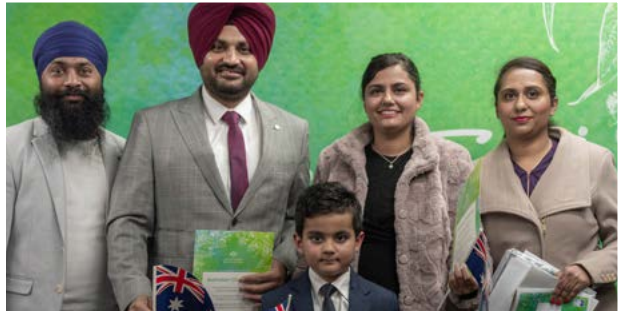
Council welcomed 19 new citizens at its Citizenship Ceremony