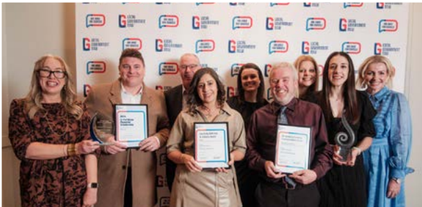
Council won a Local Government NSW Dougherty Award for its water safety campaign and a Leo Kelly Arts & Culture Award for the Bangadyi Nawi - Making a Canoe project