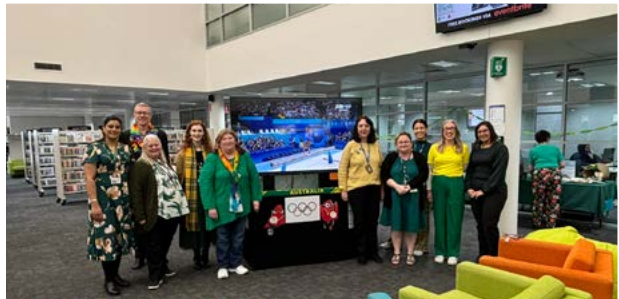
Hawkesbury Central Library was an official Olympics and Paralympics live site