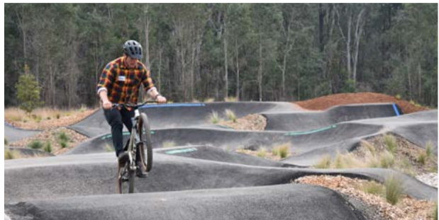
The pump track and mountain bike trails at Woodbury Reserve are now open