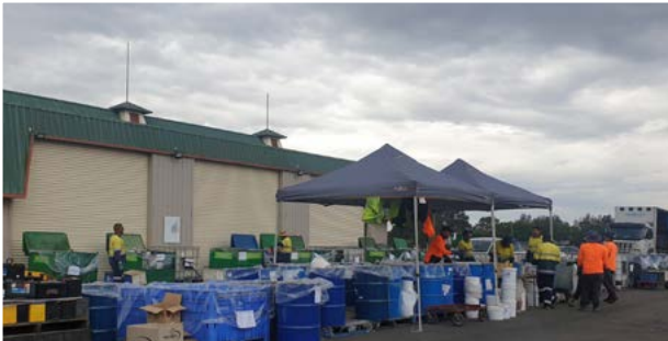
28 tonnes of chemical waste was collected at Hawkesbury's Chemical Cleanout

Council is delivering programs and infrastructure to make the Hawkesbury a great place to live. Here is a quick snapshot of some of Council's work over the last three months.