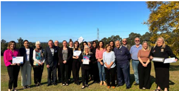
Nine community groups shared in $133,711 in grants through the annual ClubGRANTS program