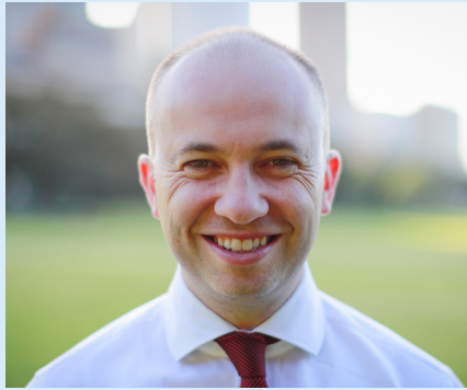
The Hon. Matt Kean MP, Treasurer, and Minister for Energy

West and South-West Sydney are already incredible places to live and this investment will deliver improved facilities, more open spaces, convenient services and stimulate the economy for the local community and generations to come.