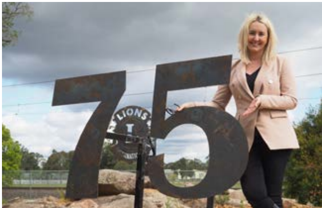
The new Lions Garden in Ham Common, Clarendon

As a local leader, I've also had the delight of participating in our new School Leadership program which Council hosted recently. It is nothing short of inspiring to see our young citizens learning about how local government operates. See more on page 8.