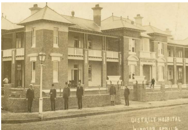
Windsor Hospital 1911.

The Local Studies Collection of Hawkesbury Library Service includes both historical and current material on the people, places and events that make the Hawkesbury unique. It was established in the 1980s to collect and care for material relevant to the Hawkesbury community. Items in the Local Studies Collection are not for loan but borrowing copies of some popular items are available to loan in non-fiction. This Fact Sheet outlines the type of Local History material available plus suggestions for additional information, and is part of a series of helpful guides to navigate your research in the Local Studies Collection.