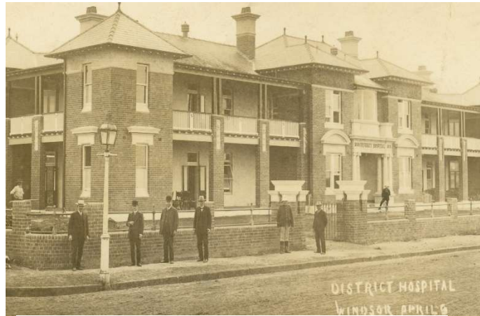
Windsor Hospital 1911.

The Local Studies Collection of Hawkesbury Library Service includes both historical and current material on the people, places and events that make the Hawkesbury unique. The collection is suitable for those wishing to conduct local history research and family history research. It was established in the 1980s to collect and care for material relevant to the Hawkesbury community. Items in the Local Studies Collection are not for loan but borrowing copies of some popular items are available to loan in non-fiction. Following is a list of the types of materials you may access plus suggestions for additional information.