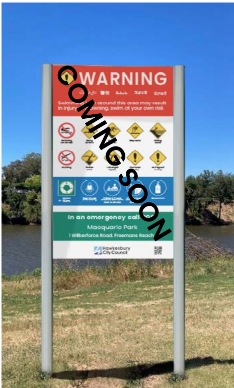
Sample sign only

Local rivers and other waterways can be dangerous places to swim, even for experienced swimmers and unfortunately, drownings have occurred in local waterways over the years. The water can be icy cold, there are submerged trees and rocks and deceptively strong currents.