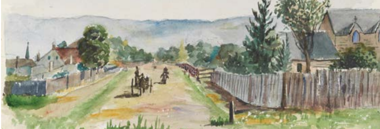
Image of Richmond by Charles Conder

Hawkesbury Sketchbook of Charles Conder - Display Well-known artist Charles Conder 1868-1909 visited the Hawkesbury in the 1880s. See the free display at Hawkesbury Central Library, 300 George Street, Windsor. Date: 28 February to 31 July 2022