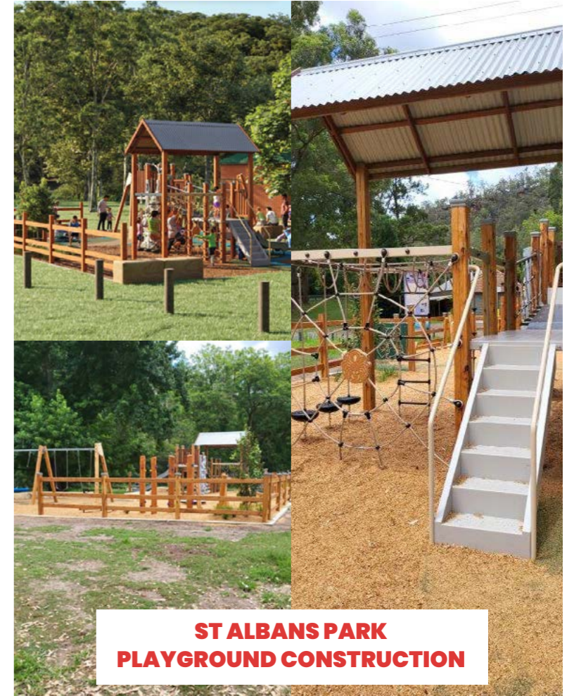
ST ALBANS PARK PLAYGROUND CONSTRUCTION