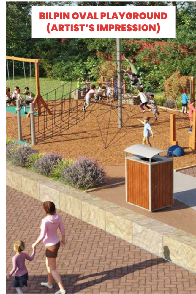
BILPIN OVAL PLAYGROUND (ARTIST'S IMPRESSION)

Follow us on Facebook at hawkesburycitycouncil for regular updates on these exciting projects.