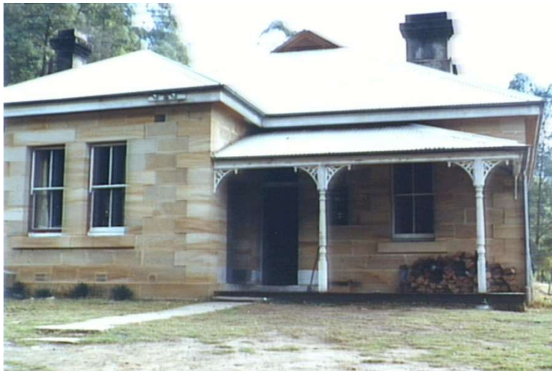
Former Court House and Police Station, St Albans circa 1980s

St Albans Court House operated in the 1850s. St Albans Court of Petty Sessions within the Windsor Police District was created in 1858 and remained in use until 1933. The records were moved to Wisemans Ferry Court of Petty Sessions and some of these are held by State Records see https://search.records.nsw.gov.au/permalink/f/1ebnd1/ORGANISATIONS1002827 In the 1890s a Court House building was constructed in St. Albans, replacing an earlier building which was damaged by floods. This building now operates as a Bed & Breakfast.