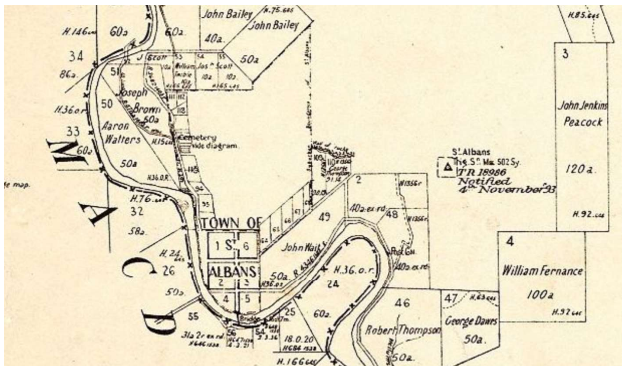
Section of St Albans Parish map. Courtesy Land Registry Service