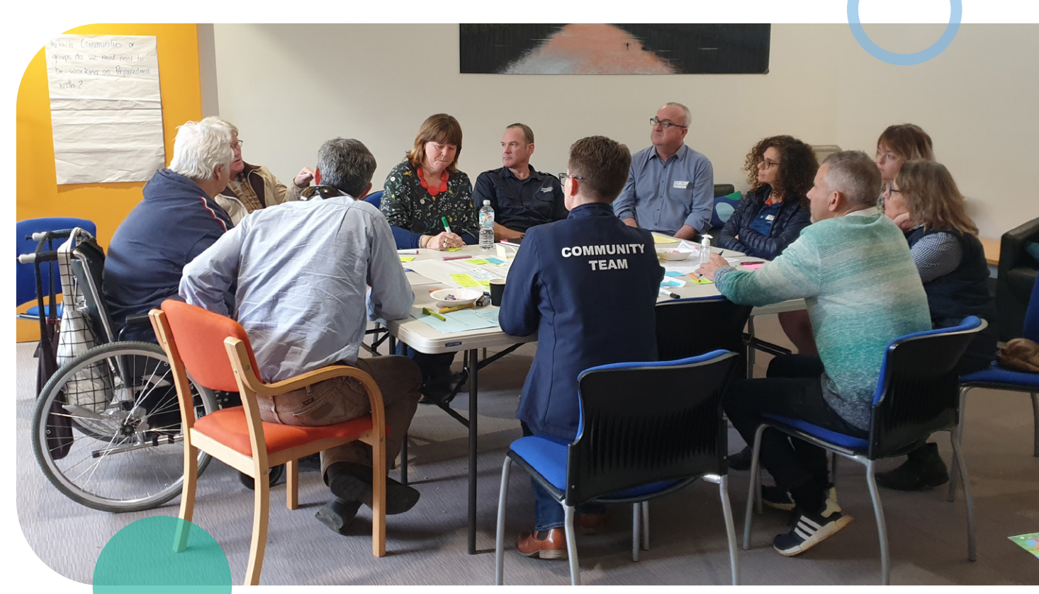
Image : A group of community members and local community services sharing in a discussion around a square table.