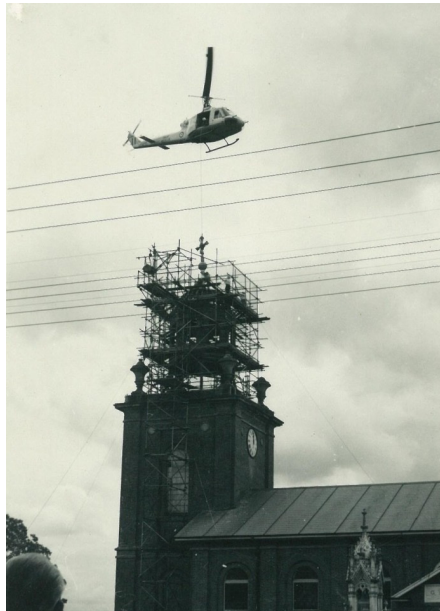
Images: Richmond RAAF supplied a helicopter and crew to place the new cross in position as part of urgently-needed repairs carried out in 1963.

All agreed it had been a very smooth and successful operation, so successful in fact that the helicopter pilots and the builders were asked to repeat the operation for the benefit of the television and newsreel crews, which failed to capture the action the first time round!