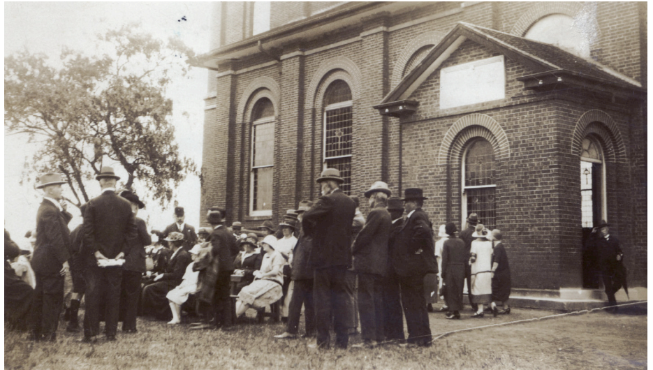
The 108th anniversary of the church, 1925

While a good number of people turned up for the inaugural ANZAC DAY service in 1916, it was a different story after the Second World War, when it was noted in an Australian