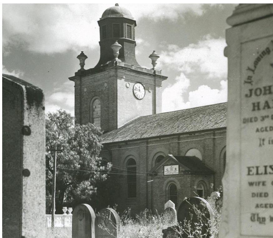
The church and graveyard in 1948