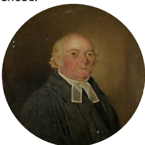
Samuel Marsden, 'the flogging parson'

When Macquarie appeared on the scene in 1810, he changed the name of the settlement from Green Hills to Windsor, laid out streets and squares, and identified the site for a church at the top of a 'great square'. Planning for St Matthew's – by foundation stone, the oldest remaining Anglican Church in Australia - had commenced.