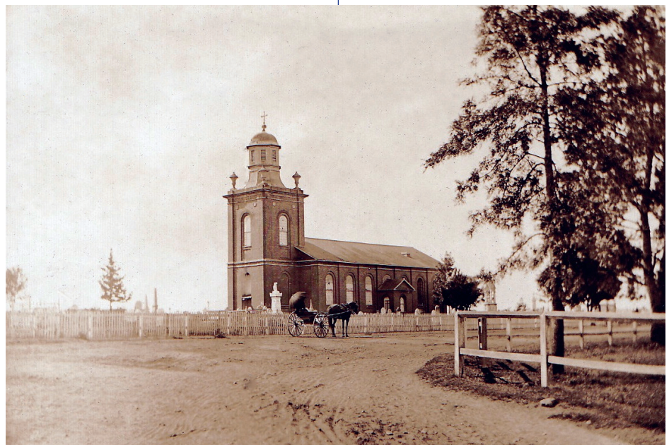
St Matthew's Church, Windsor c.1905

Architect Francis Greenway had been convicted of forgery, and sentenced to death, commuted to 14 years transportation. He was self-confident, temperamental, and quick to take offence, but his artistic abilities were great, and he was one of a number of Emancipists (convicts who had done their time) to be picked up and promoted by Macquarie, who made good use of his talents.