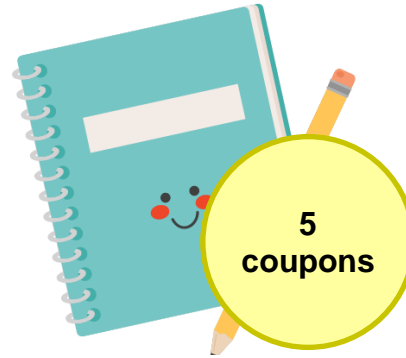
Notebooks and Sticker Books