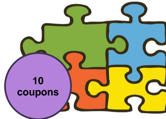
Craft and Puzzles