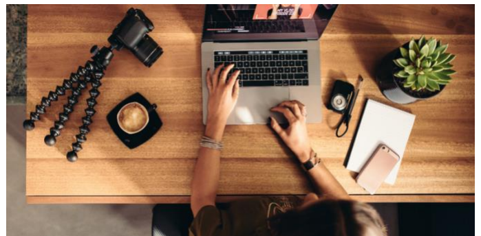
Tax time for creatives Friday 23 June, 3pm-5pm (online)