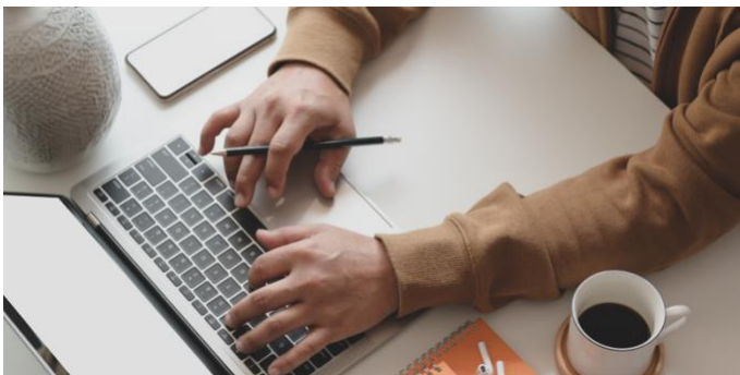
Government tenders and panels Monday 26 June, 4pm-6pm (online)