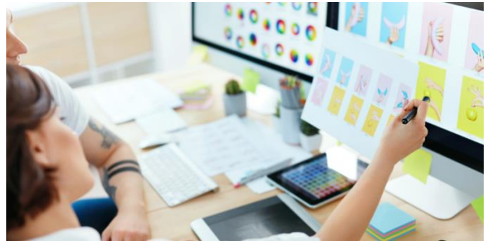
Website strategy for creatives Tuesday 13 June, 5pm-7pm (online)