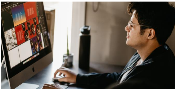
How to start a creative business Wednesday 21 June, 6pm-8pm (online)