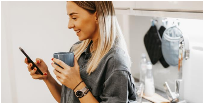
Social media for creatives Tuesday 6 June, 5pm-7pm (online)