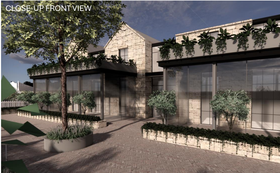
CLOSE-UP FRONT VIEW