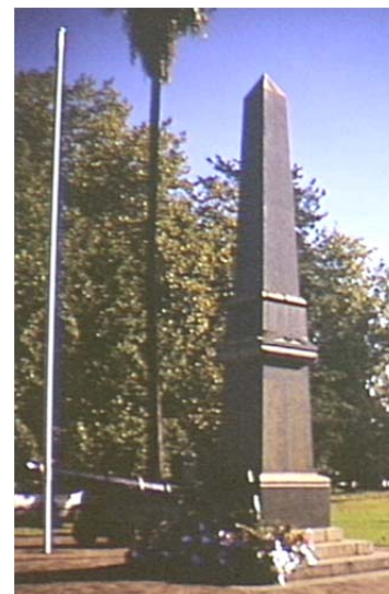
Richmond War Memorial pictured

If you have information about any other Honour Rolls in the local area, please advise the Local History Librarian on history@hawkesbury.nsw.gov.au