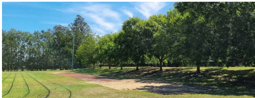
Figure 3: Trees planted on northern mound

Figure 2 shows the difference character areas of the existing site.