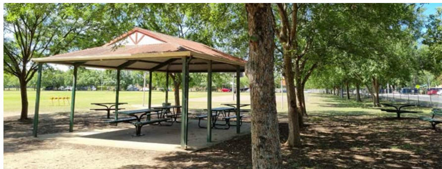
Figure 4: Shaded picnic shelters