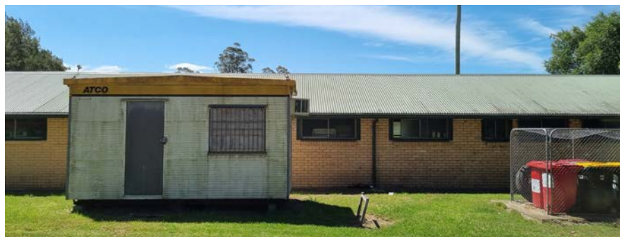
Figure 5: Building and temporary structures