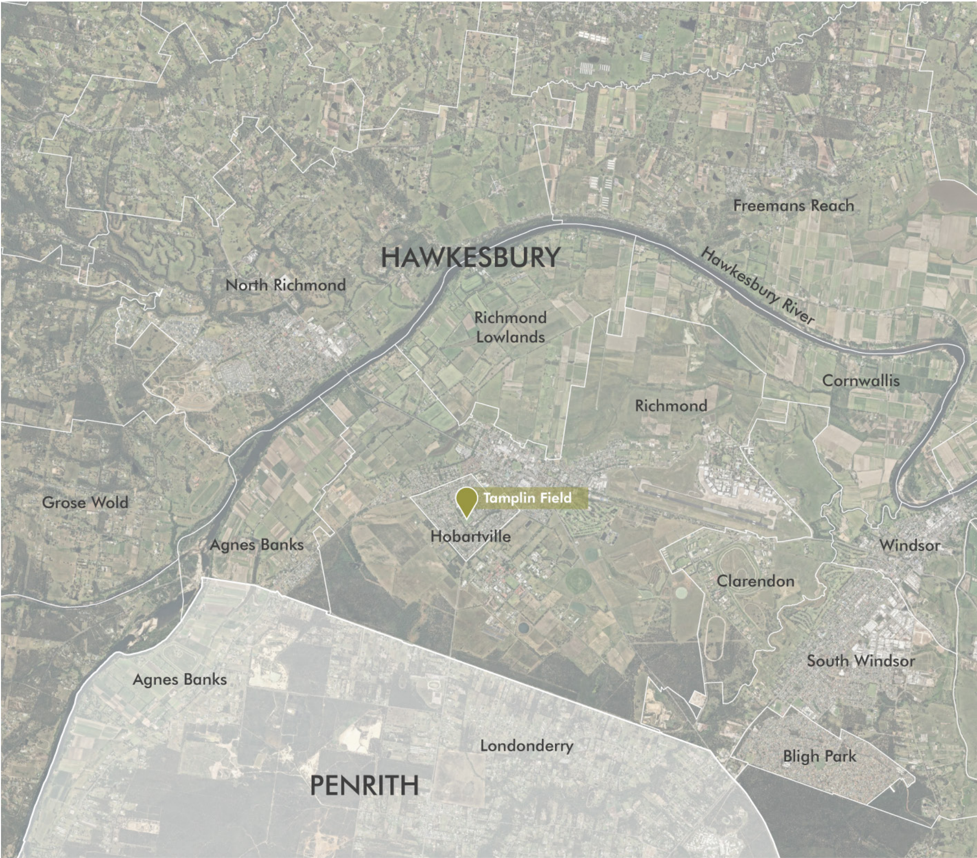
Figure 1: Site context plan

The Traditional Owners and Custodians of the Hawkesbury region are the Darug and Darkinjung people.