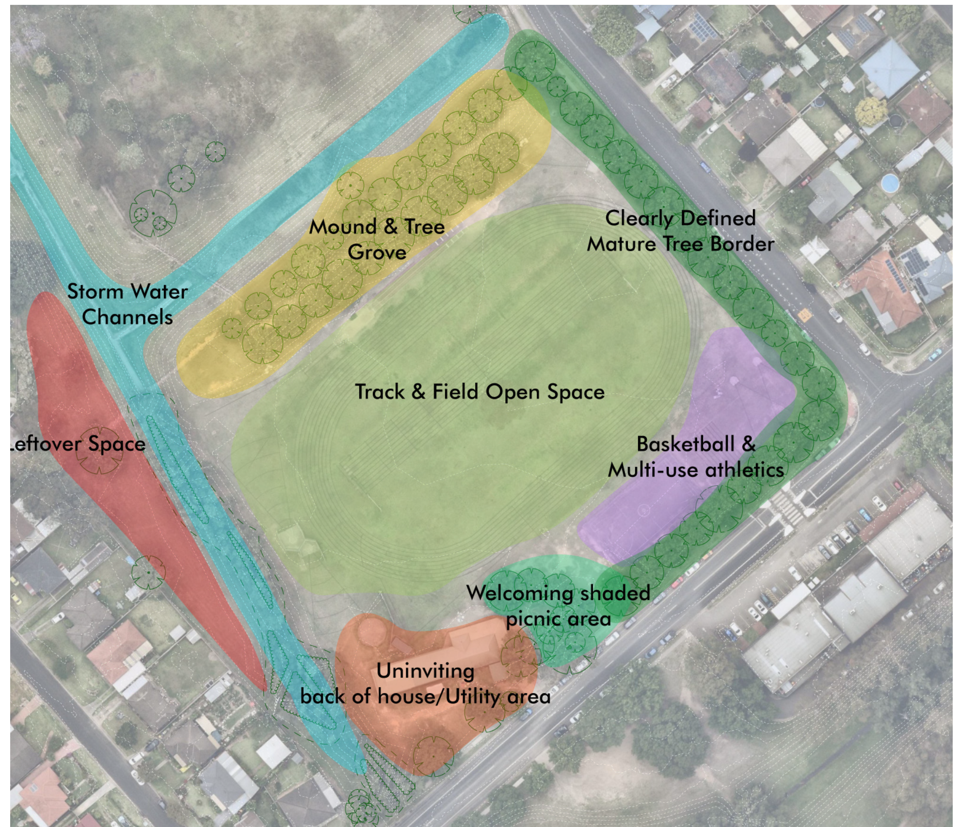
Figure 2: Site character analysis