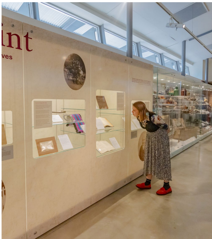
Image: Bridging the Hawkesbury/Dyarubbin: the History of the Windsor Bridge , installation view.

Bridging the Hawkesbury/Dyarubbin: The History of Windsor Bridge features never before seen images and original objects from the bridge shown for the first time.