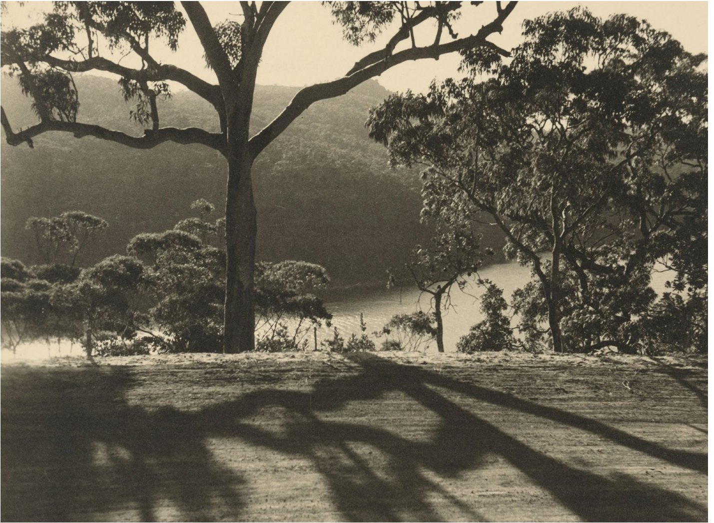
Image: Olive Cotton, The patterned road , 1938, National Gallery of Australia Kamberri/Canberra, purchased 1983