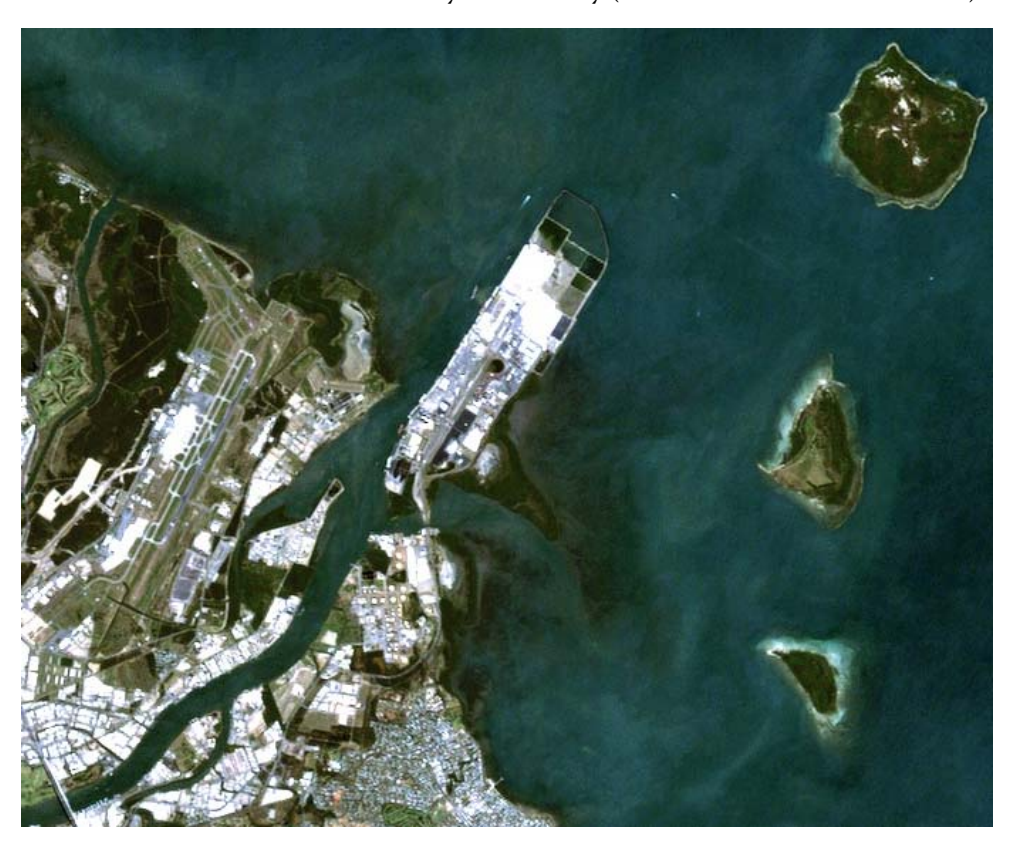
Figure 2: Satellite map of the Port of Brisbane showing the Fisherman Islands wharf facilities in the centre. A supplementary fleet base could be developed at a new reclaimed land site extending further into Moreton Bay from the current facilities and linked to the Port of Brisbane by a causeway.