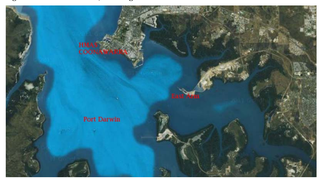
Figure 3: Darwin harbour, showing HMAS Coonawarra and East Arm wharf.