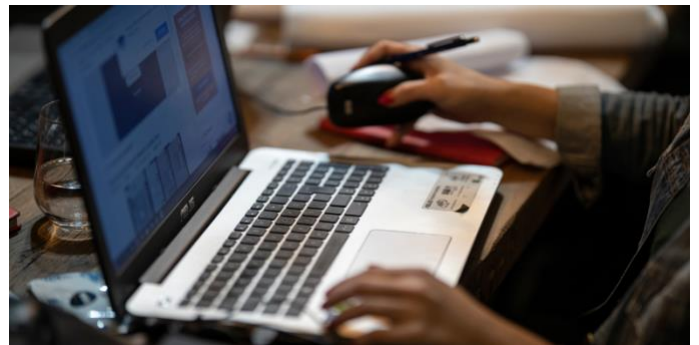
Cybersecurity and digital currency Tuesday 7 March, 6pm-8pm (online)