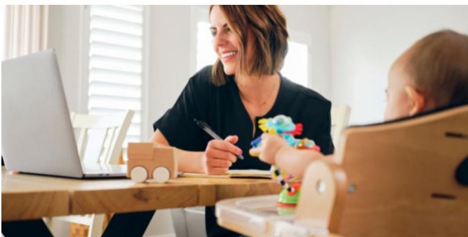
Worklife balance for women Wednesday 8 March, 1pm-2pm (online)