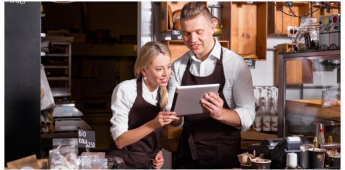
Pricing strategies for new businesses Thursday 2 March, 10am-12pm (online)