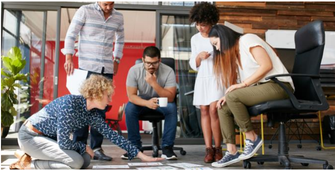
Networking tips and techniques for creatives Wednesday 1 March, 6pm-8pm (online)