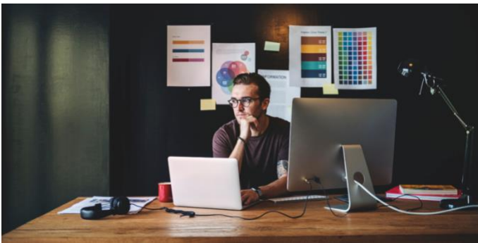
Wellbeing for creative business Thursday 2 March, 6pm-8pm (online)