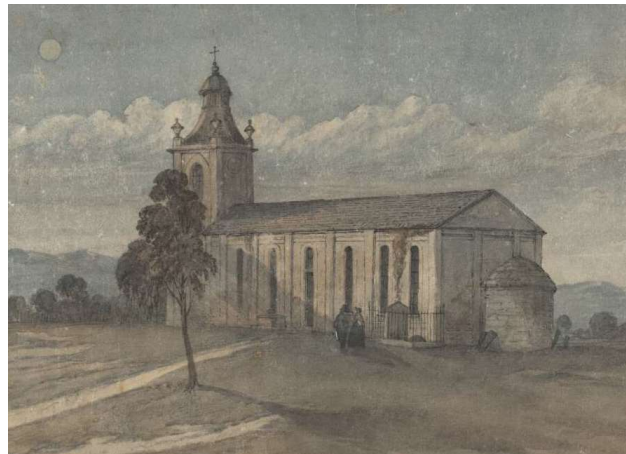
St Matthew's Church prior to porch

The building recommenced, with Greenway at the helm, and it appears he tweaked his original design at this time making it one storey instead of two. The church was named St. Matthew's however St Andrew's was suggested.