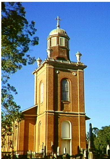
St Matthew's Anglican Church, 1994

Also check Trove as there are many images available https://trove.nla.gov.au/