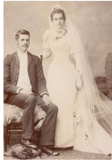
Unidentified bride & groom

There are no membership fees, so anyone interested in family history is more than welcome to attend meetings, which are held 10-11.30am every 2 nd Wednesday of the month except January. The group meets in the Tebbutt Room, Deerubbin Centre, 300 George Street Windsor, NSW 2756. Since Covid, there two options in attending, in person, or via Zoom if you are unable to attend in person. Meetings are not recorded.