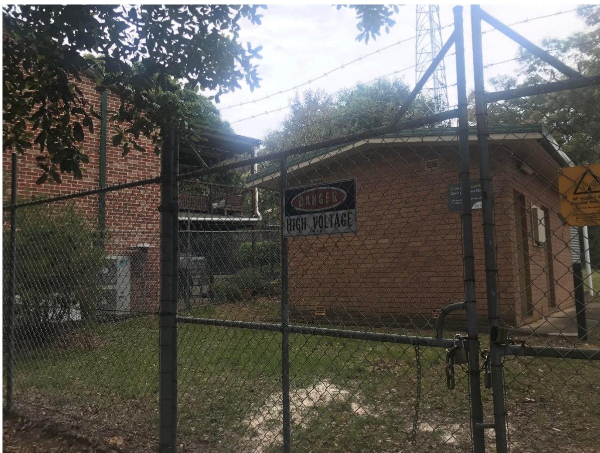
(a) Proposed tower location site. We have had this emergency 15m