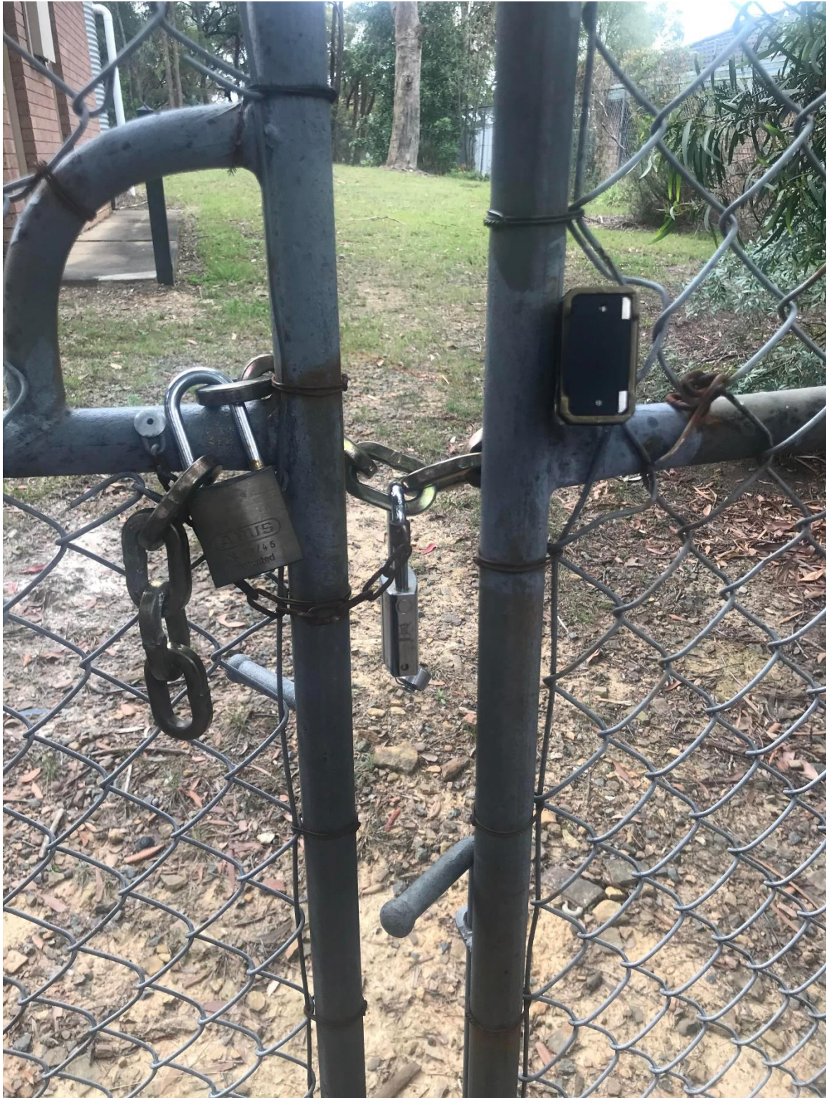
(B) – Not secure.