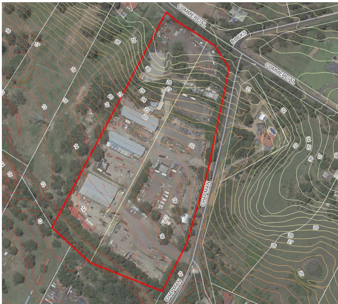
Figure 1 - The Site

It contains moderate falls from north to south, with a high point at RL.33.5 at the Commercial Road frontage and low point as Kilarney Chain of Ponds cuts through the southwestern corner of the site at RL.12.0. It is shown in Figure 1 below.