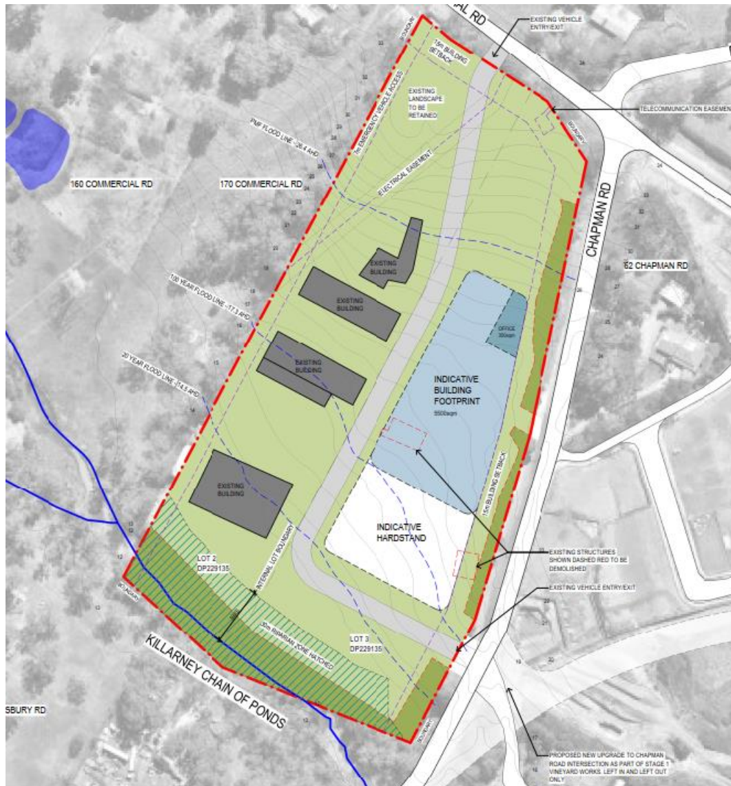
Figure 2 - Proposed Site

The application seeks to amend the existing LEP to permit additional uses on site. This includes maintaining the existing site access points off Chapman and Commercial Roads, retaining the existing buildings on site and adding additional hardstand areas between the 1 in 20-year and 1 in 100-year flood levels and building areas above the 1 in 100-year flood level.