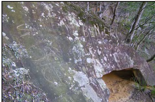
PHOTO 24: Vandalism to rock outcrops and overhangs. Extensive multiple tracking to rope ladders and swings (11.08.2006).