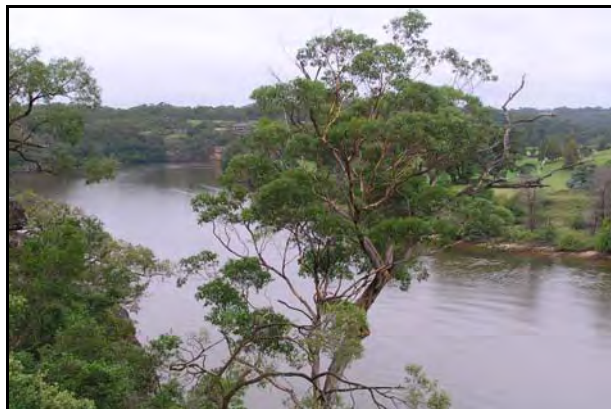
PHOTO 2: View of Hawkesbury River looking north-east from the sandstone scarp (01.02.2008). The river and riparian corridor provided a vast range of resources for the Darug Aboriginal people.