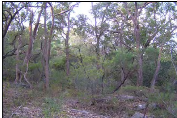
PHOTO 10: Sydney Sandstone Ridgetop Woodland along top of sandstone scarp/ lookout (01.02.2008).