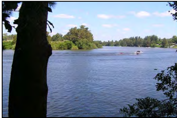
PHOTO 1: View of Hawkesbury River looking south-east from the 'pinch-point', northern valley (10.01.2008).