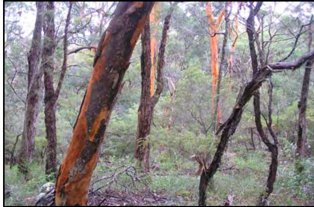
PHOTO 9: Sydney Sandstone Ridgetop Woodland near Portland Head Road – Grey Gum and Narrow-leaved Apple (01.02.2008).