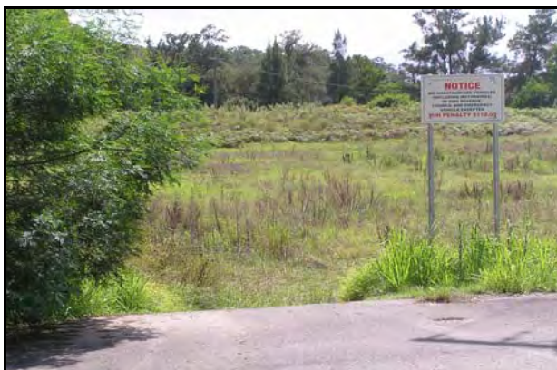
PHOTO 20: Signage restricting unauthorised vehicular access via 4WD track – no existing physical barriers or controls (29.02.2008).