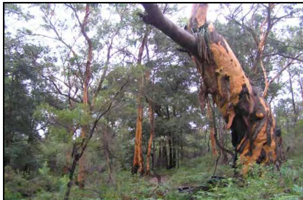
PHOTO 8: Sydney Sandstone Ridgetop Woodland along upper track to Tizzana Road – old growth Grey Gum ( Eucalyptus punctata ) (01.02.2008).