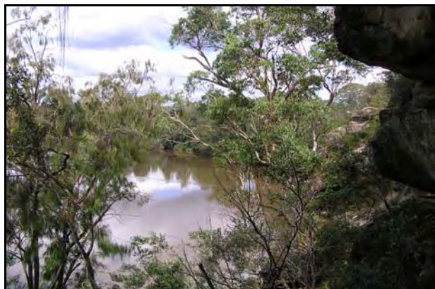
PHOTO 11: Shale Sandstone Transition Forest and rock outcrops along lower scarp [looking south] (29.02.2008).