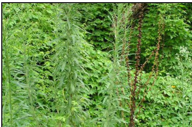
PHOTO 14: Upper riverbank near old house site is dominated by exotic weeds/ Balloon Vine [background] (01.02.2008).