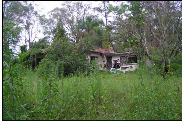
PHOTO 17: Old house and garden – dense cover of exotic weeds. Die-back is occurring in remnant native canopy trees (BMAD) [background] (01.02.2008).

from native canopy trees. The weed management and regeneration/ restoration strategy should be integrated with proposed passive recreational uses/ development (ie. walking tracks and picnic area – refer to 4.6 Public access and recreation ). It should also be monitored in relation to changes in the Bell Miner population and localised dieback of native canopy species (BMAD – see previous discussion).