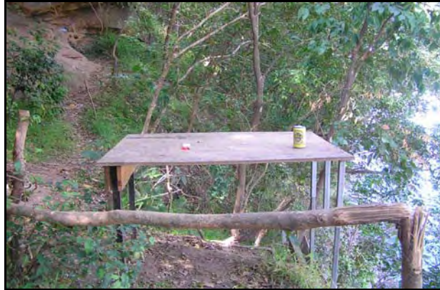
PHOTO 22: The 'pinch-point' – unauthorised structures/ platforms for rope swings, tree felling, soil compaction and erosion (10.01.2008).