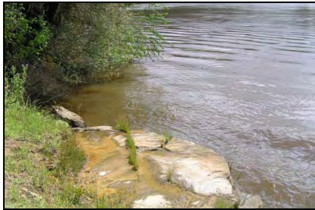
PHOTO 15: Riverbank near south-eastern boundary – Black Willow ( Salix nigra ) [background] is a notifiable noxious weed (29.02.2008).

Aquatic and semi-aquatic weed species are highly adaptive and invasive under prevailing river conditions. They have a rapid capability for expansion creating stream blockages, modifying and reducing native aquatic habitat and affecting water quality and recreational opportunities ( LandArc, 2007 ).