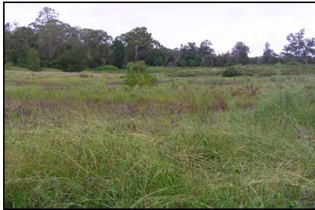
PHOTO 16: Remnant wetland (southern valley), dominated by exotic weeds, should be restored following blocking/ removal of sub-surface drainage line (01.02.2008).