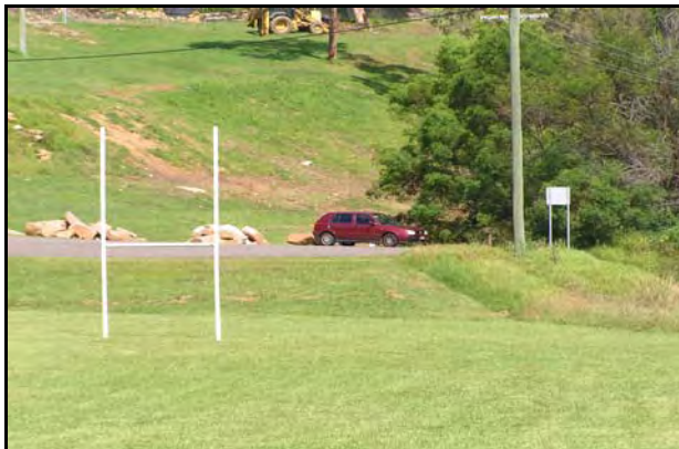
PHOTO 19: Main entry point from Swallow Reach Place cul-de-sac – private playing field and broad-scale mowing within reserve (29.02.2008).