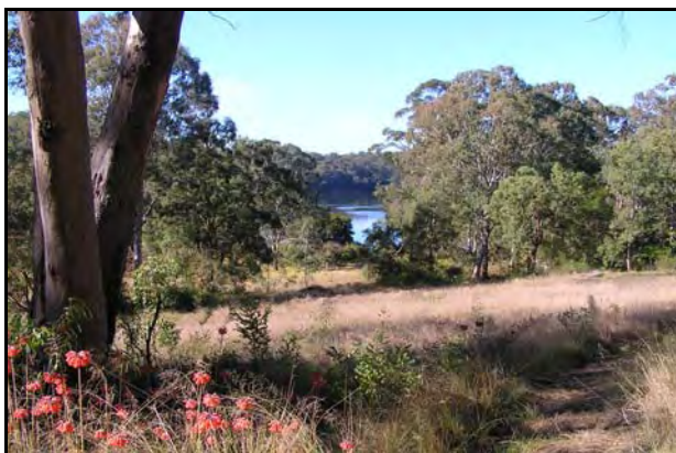
PHOTO 13: View from middle ridge looking north-east – exotic pasture grasses/ garden escapes [left foreground] (11.08.2006).