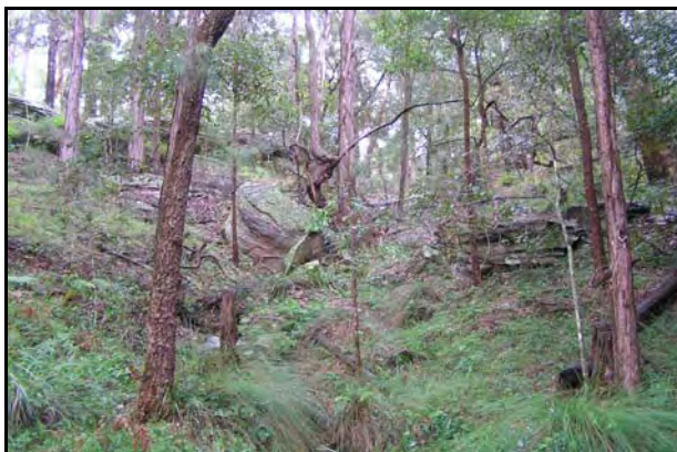
PHOTO 5: Shale Sandstone Transition Forest – lower western gully near the walking track to Tizzana Road (01.02.2008).