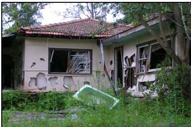
PHOTO 21: Vandalised old house on middle ridge – proposed for demolition and site restoration (01.02.2008).