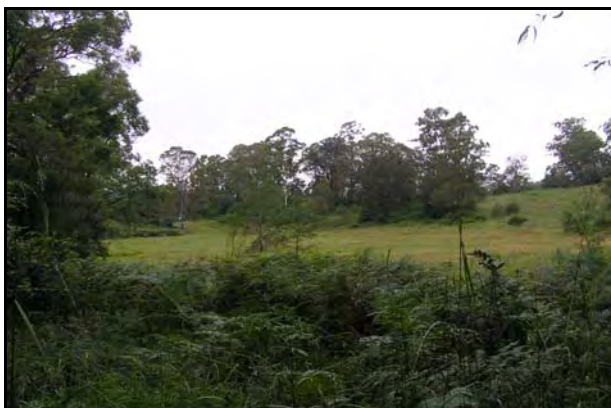
PHOTO 4: Northern valley – Freshwater Wetlands were drained and farmed but still retain a high level of biodiversity (01.02.2008).