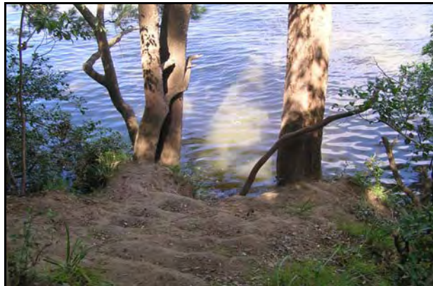
PHOTO 23: Rope swing, multiple tracking, trampling/ removal of vegetation cover and soil erosion at the 'pinch-point' (10.01.2008).