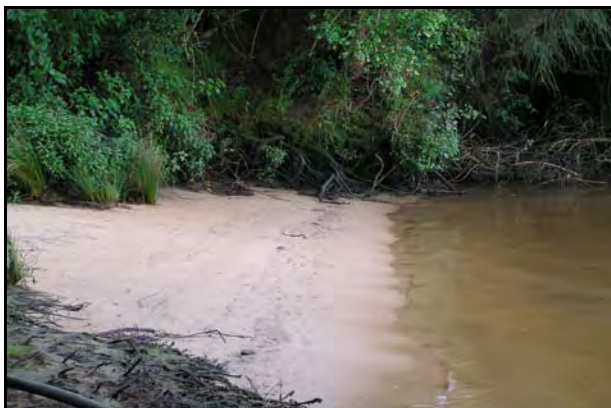
PHOTO 3: Small beach (south of old house site) – River-flat Eucalypt Forest on steep riverbanks and extensive weed growth (01.02.2008)