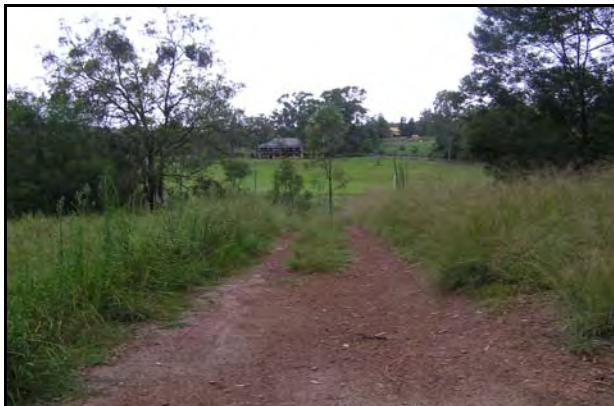
PHOTO 12: View looking south from middle ridge – cleared paddocks dominated by exotic pasture grasses (10.01.2008).