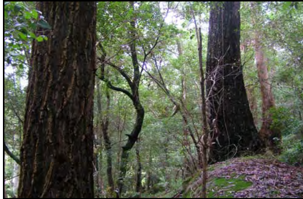
PHOTO 6: Western Sydney Dry Rainforest with old growth emergent Ironbarks – lower southern slope (northern valley) (01.02.2008).