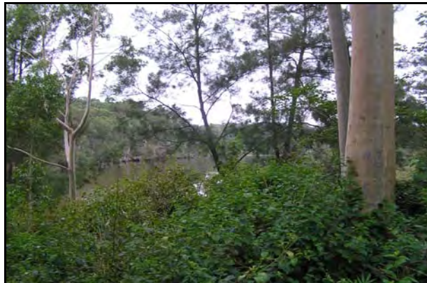
PHOTO 18: Scenic vistas from old house and garden are obscured by dense weed growth ( Lantana sp.) [foreground]. Lemon-scented Gums [right foreground], planted as garden specimens, are seeding prolifically (01.02.2008).