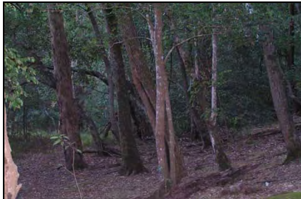
PHOTO 7: Western Sydney Dry Rainforest with dominant Grey Myrtle ( Backhousia myrtifolia ) (northern valley) (01.02.2008).