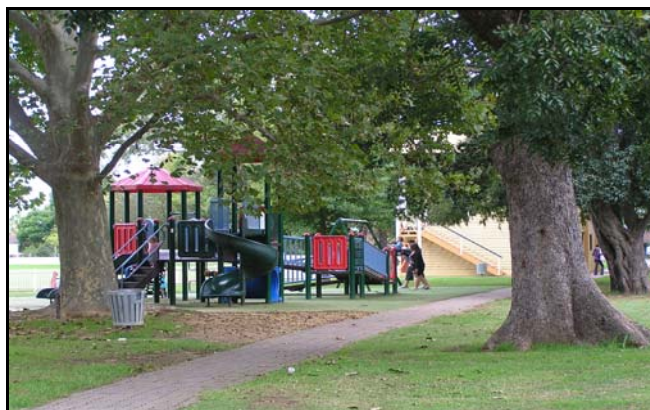
PHOTO 5: Richmond Park – view of children's playground and heritage trees incl. Red Cedar [right foreground] (06/04/2009).