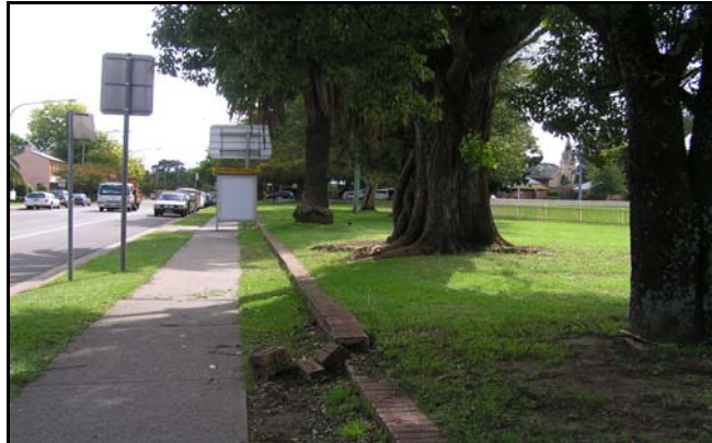
PHOTO 3: Richmond Park – view looking west along March Street frontage showing damaged brick edging (06/04/2009).