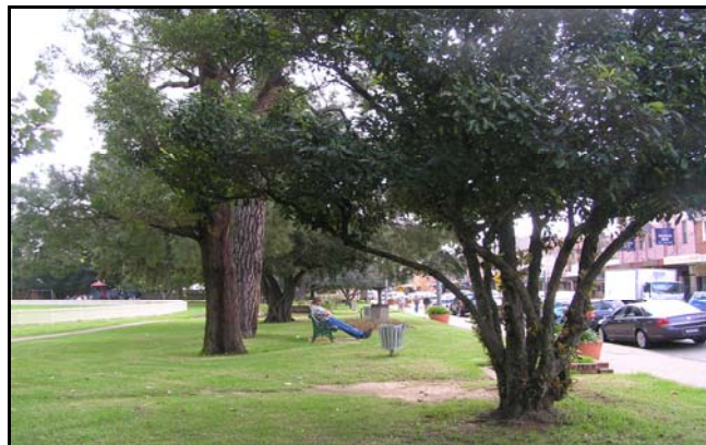
PHOTO 1: Richmond Park – view looking west along Windsor Street frontage with shops [right background] (06/04/2009).

NOTE: Condition of cultivated trees [native & exotic]* varies throughout the park. Some trees display physical damage, dead wood, cavities/ insect damage and should be inspected by a qualified arborist.