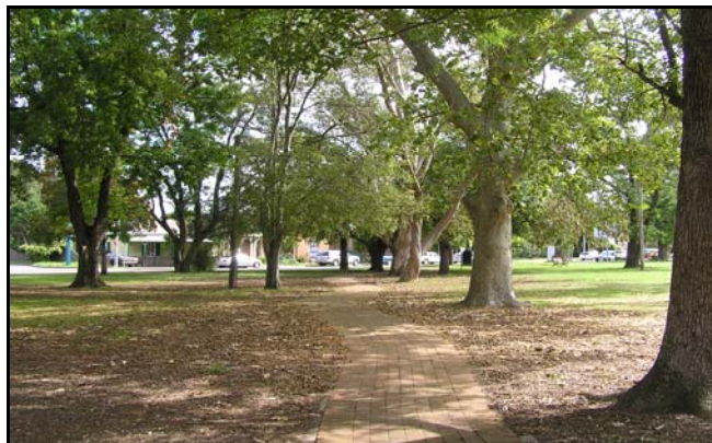
PHOTO 11: The south-east corner of the park was lost to rail development for almost 30 years. The existing sinuous pathway and signage will be replaced with a more accurate interpretation of the former rail alignment (06/04/2009).