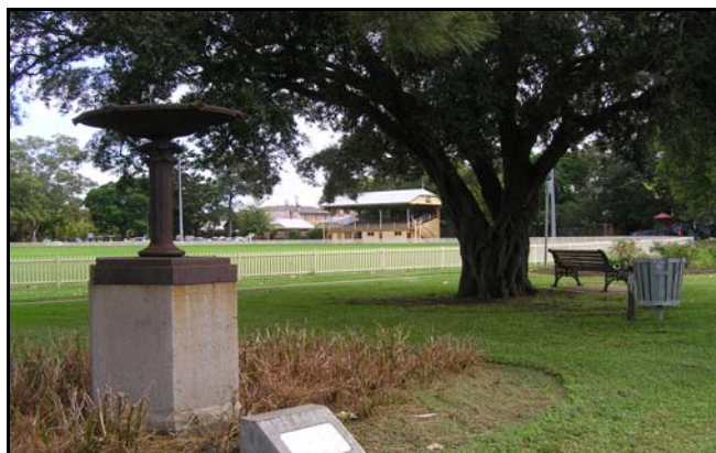
PHOTO 8: Cast-iron fountain on plinth (1892) [left foreground] & African Olive (c.1860s-1870s) [right background] (06/04/2009).