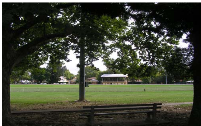
PHOTO 14: A phased program of replacement tree planting needs to be consistent with the planting palette and layouts established in the late 19 th / early twentieth century (06/04/2009).