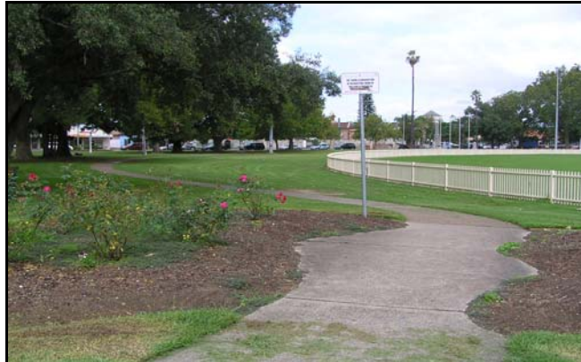
PHOTO 9: View looking south-east near Windsor Street – early gravel pathways around the oval, linked to key entry points, have long disappeared. Existing pathways are ad hoc (06/04/2009).