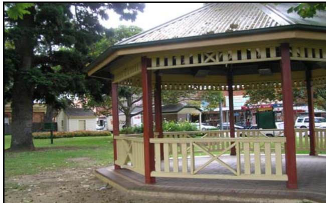
PHOTO 10: The 'antique-style' rotunda, installed in 2002, has little local significance. The park has experienced considerable development in recent decades (06/04/2009).