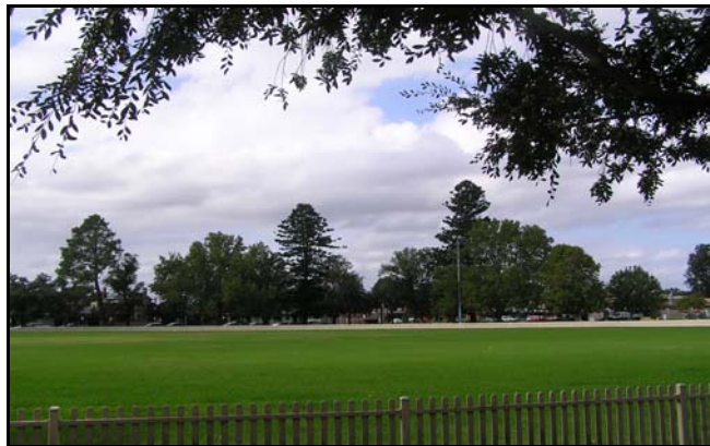
PHOTO 15: Richmond Park – The Plan of Management aims “to conserve, manage and enhance the park’s cultural heritage and mix of sporting and passive recreational opportunities”.

“To ensure appropriate protection, conservation and sustainable management of the park’s landscape setting, its rich cultural heritage, social and recreational values in accordance with the objectives of community land management for the benefit of the broader community and for future generations”.