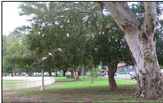
PHOTO 13: The ageing population of significant trees, like this magnificent River Red Gum [right foreground], needs appropriate arboricultural care and management (06/04/2009).