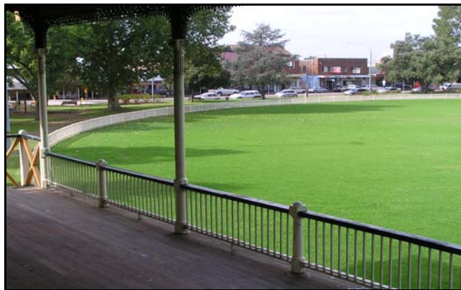
PHOTO 4: Richmond Park – view from pavilion (built 1883/ restored 1993-94) looking north-east over the oval (06/04/2009).