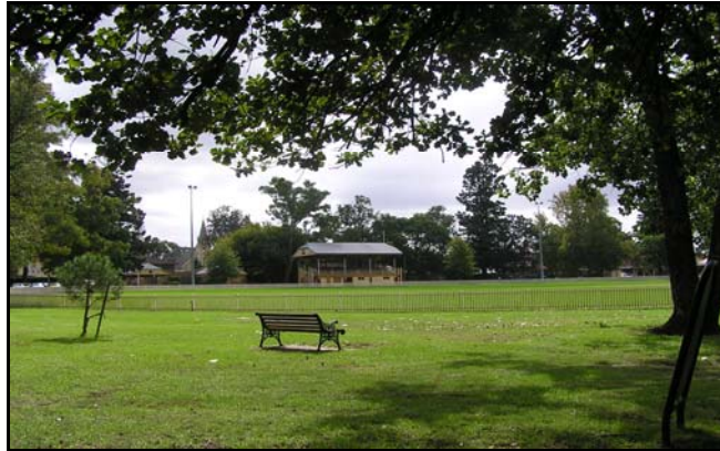
PHOTO 6: Richmond Park – view of oval and pavilion “...a long association with cricket” and “historic resonance of restored pavilion” [CMP 2003] (06/04/2009).