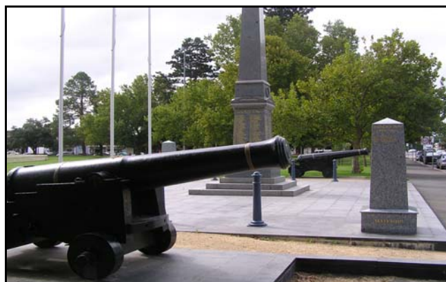
PHOTO 2: Richmond Park – view of WWI memorial looking north along East Market Street (06/04/2009).