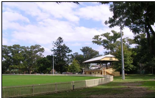
PHOTO 7: Richmond Park retains key elements from its 1860s -80s layout – the oval/ pavilion and an outstanding collection of significant trees along the park boundaries (06/04/2009).