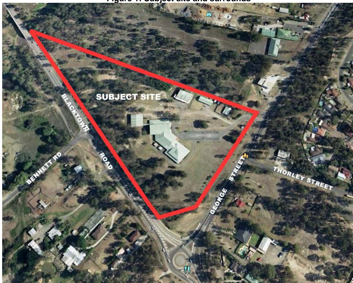
Figure 1: Subject site and surrounds

The site has an area of approximately 6 hectares, and is located on the northern corner of the intersection of Richmond Road, Blacktown Road and George Street, Windsor. The site is generally triangular in shape with a south-western frontage to Blacktown Road, a south-eastern frontage to George Street and a north-northeastern boundary which adjoins a property currently used for a service station. A small north-western boundary adjoins Rickabys Creek. The site and surrounds is shown in Figure 1 below.