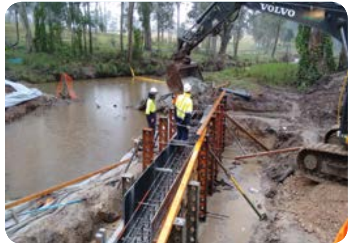
Reconstruction of Stannix Park Road Bridge is now in full swing.