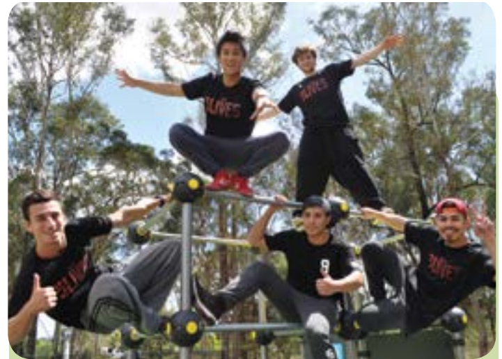
Team 9 Lives at Bligh Park on the new Parkour equipment.

One option Council wants to explore is an affordable rental housing partnership using Council owned land, or encouraging partnerships on private land in new housing areas.