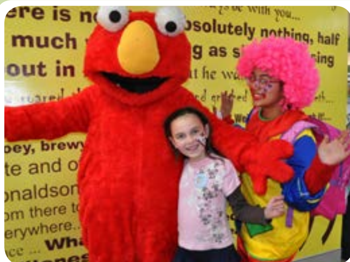
Locals enjoyed the Deerubbin Centre's birthday bash.

Over $1 million in funding and upgrades provided to the Richmond Swimming Centre by Council and the State Government over the last decade has enabled the Swimming Centre to provide a great source of fitness and recreation for residents, visitors, swim clubs and schools.