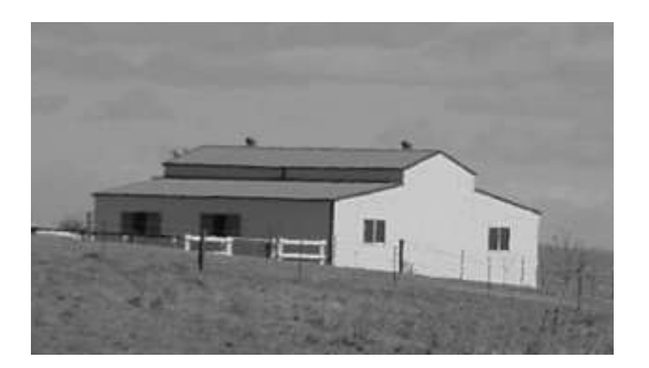
Figure 2: Less Bulky Appearance of Barn Style Roof Forms