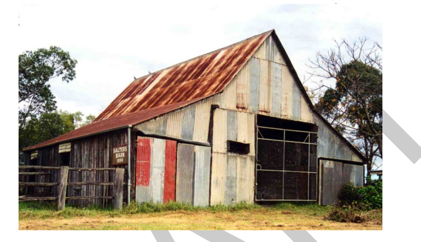
Figure 4: Slab Barn Style building