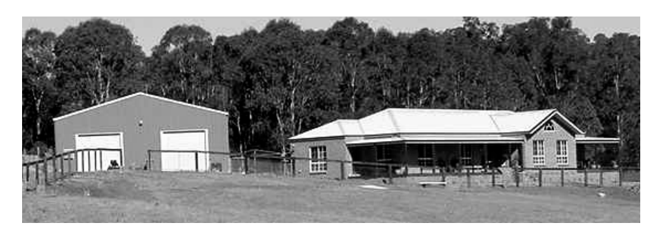
Figure 3: Visual dominance of the shed (on left) due to its excessive height